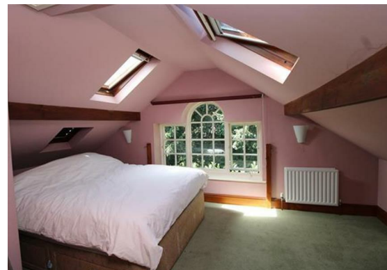
Family Room 24'8" x 16'1" (7.52 x 4.90)