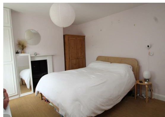
Cellar 11'1" x 10'2" (3.38 x 3.10)