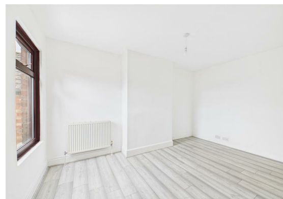
Bedroom Three 8'10 x 7'7 (2.69m x 2.31m)