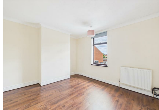
Lounge 12'1 x 10'6 (3.68m x 3.20m)